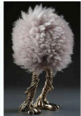
Haas Brothers' Poowee Fur-man , 2017, at Lora Reynolds Gallery, exhibiting at Dallas Art Fair