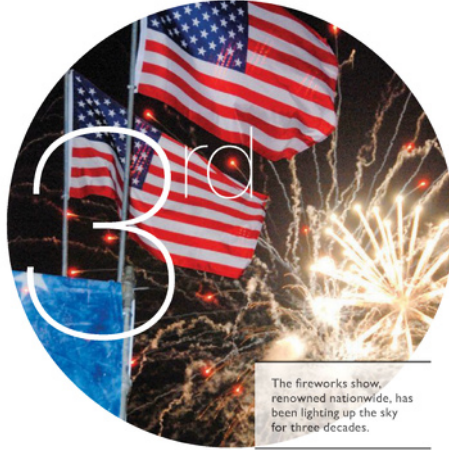
The fireworks show, renowned nationwide, has been lighting up the sky for three decades.

THROUGH 7/16 México 1900-1950 Explore 50 years of Mexican modern art including pieces from renowned artists such as Diego Rivera, Frida Kahlo and José Clemente Orozco. With almost 200 works, including sculptures and photography, this exhibition highlights the history of Mexico, cultural development, and, of course, art. Tickets $16, Dallas Museum of Art, dma.org