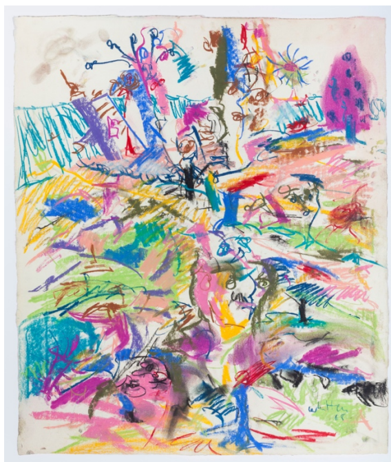
Jack Whitten | Untitled | 1968 | pastel on paper | 26.5" x 22.5"

Opening reception on Sat., April 1, 2017, 5:00 to 8:00 p.m. at Bivins Gallery in the Uptown Dallas Crescent complex.